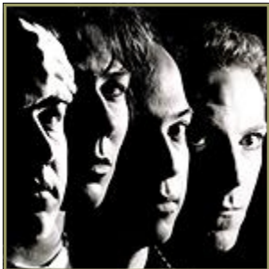
The Pixies – Waiting for Them